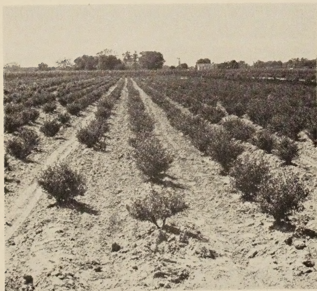
Ilex crenata rotundifolia Photographed Sept. 6, 1952